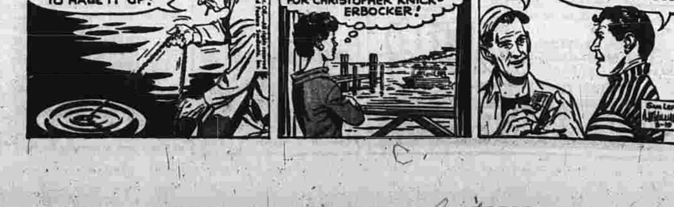
NOTICE BY LEFF and McWILLIAMS