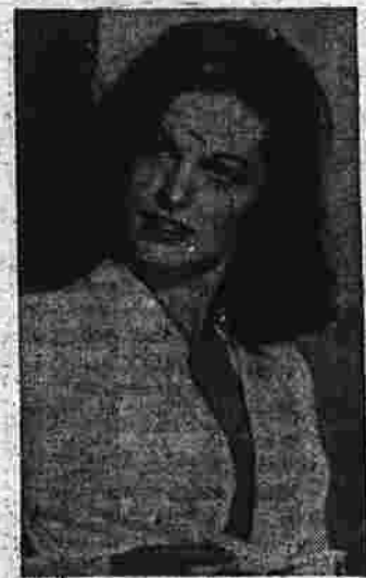
JOYCE TAYLOR plays a feminine member of a hoodlum gang in "Ring of Fire," on Tuesday Night at the Movies, 9 p.m., Channels 22 and 30.

town. Marion Brando, Mary Murphy, Bob Keith, (8) Mevie Festival of Hits "Lost World" Claude Rains, Jill St. John. Zoology professor leads group on 50,000-mile American expedition in search of "lost world."