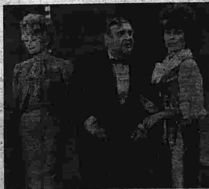
Lucille Ball, Zero Mostel and Carol Burnett in a skit from their CBS special, "Carol Plus Two" to be seen Tuesday night at 8:30 on Channel 3, WTIC-TV.