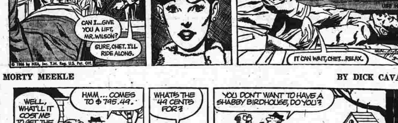
MORTY MEEKLE BY DICK CAVALLO