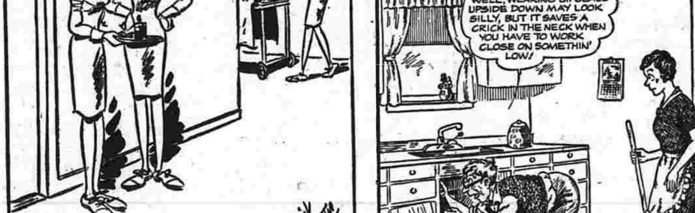
OUT OUR WAY BY J. B. WILLIAMS