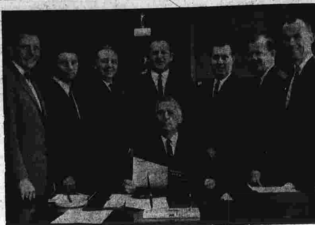
These men recently qualified for the President's Club with John Hancock Mutual Life Insurance Co. They earned the honor by being in the top one per cent of all Hancock sales representatives in the nation, and will attend the President's Club meeting in Miami this month.

Colonial Bank Co. reports a substantial increase in net income for 1965, as compared to 1964. Net income for the year ending Dec. 31 was $183,333, or $1.17 per common share, as compared to $127,770, or 82 cents per common share, for the year ending Dec. 31, 1964.