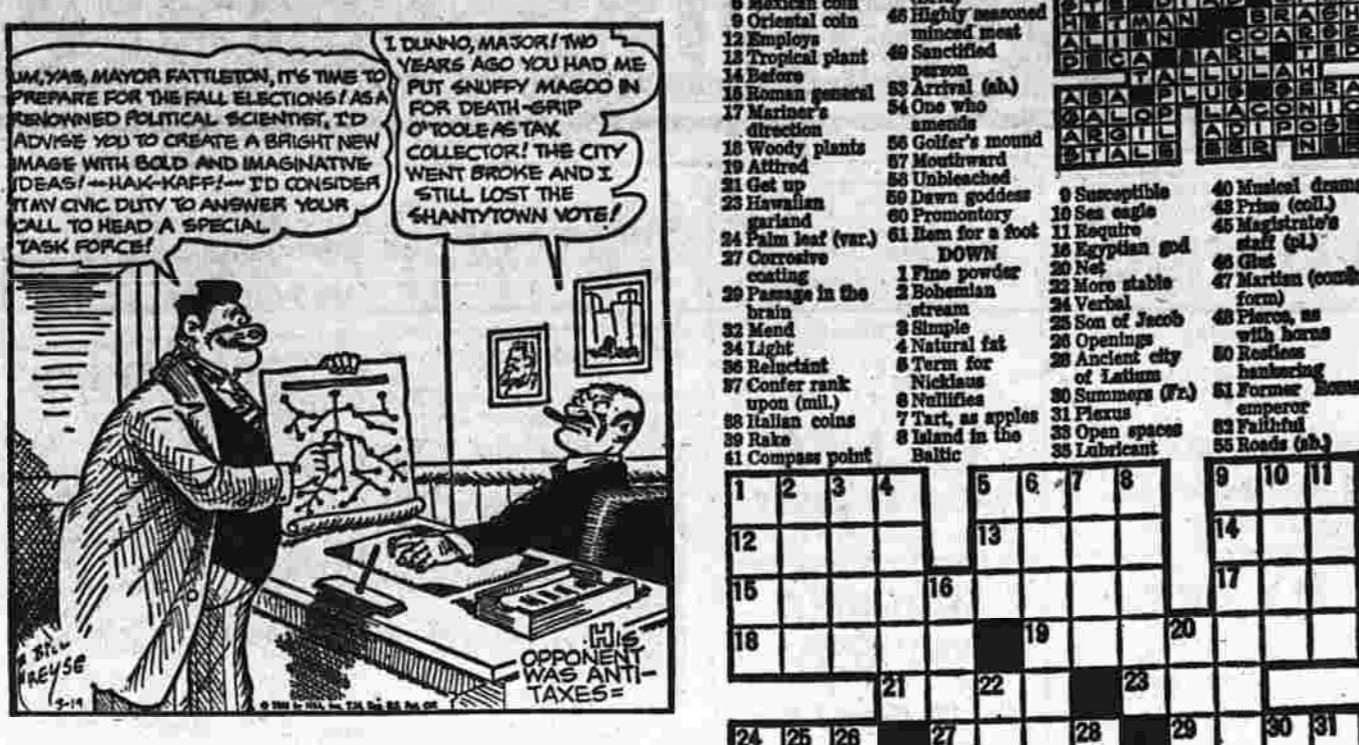
WORLD COINS BY DICK TURNER

BY ROUSONOUR BOARDING HOUSE with MAJOR HOOPLE